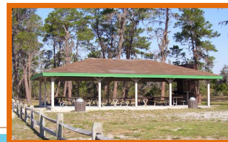
Rye Pavilion - may be reserved. Call office for information - 941-742-5923 ext 6045

Remember: All plants, animals, and historical artifacts in the preserve are protected from harassment, damage, or removal.