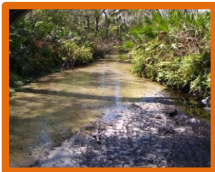
Creek on west side of Rye homestead and cemetery.

In 1910, the United States Government dredged the Manatee River from Tampa Bay east to Rye to allow steamships access to the small settlements that were scattered along the river. The river steamship allowed the community to flourish. At its peak, the Rye settlement was occupied by 72 families, with stores, sawmill, gristmill, post office, and school.